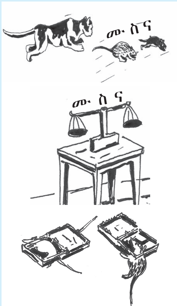
Picture 2.3. Combating corruption promotes justice