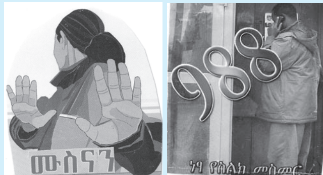
Picture 2.4. Combating corruption is the duty of every society

Answer the following questions on basis of the picture above.