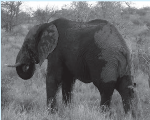
Picture 11.1. Elephant of Africa