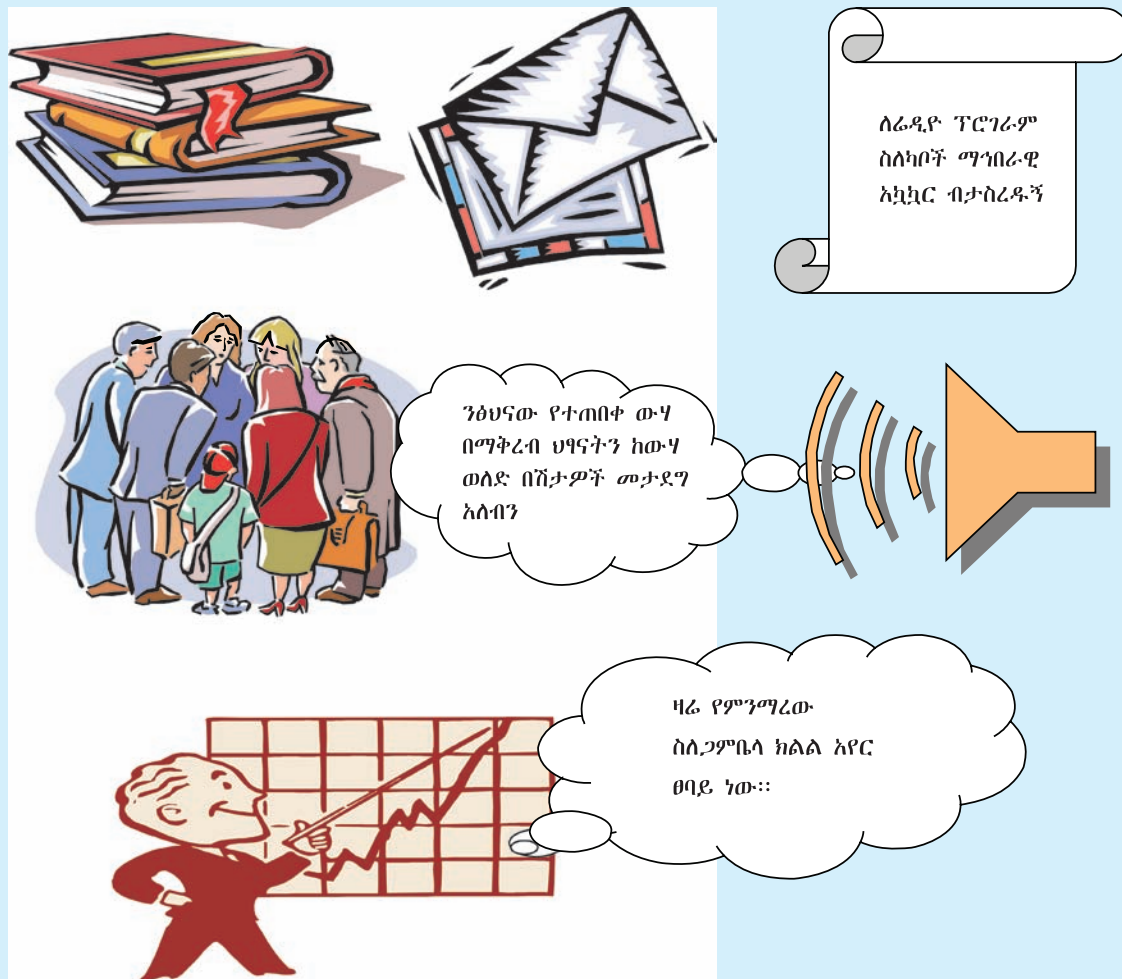
Picture 11.3. Ways in order to enhance knowledge

1. What do you understand from the above pictures? Discuss.