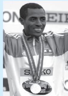
Picture 11.2. Athlete Tirunesh Dibaba and Kenenisa Bekele