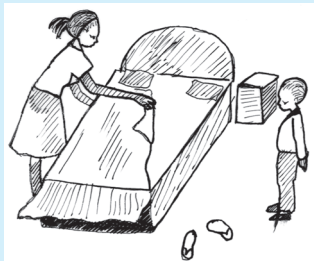
Picture 8.2. When 10 years old child ordering other person to make a bed