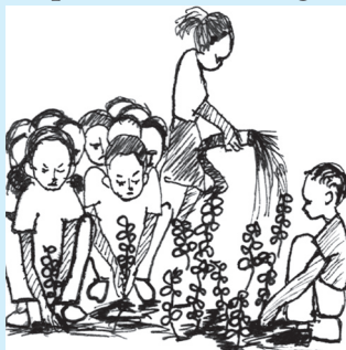
Picture 8.4. Campaign of planting trees

A person cannot possess all types of knowledge. Hence, a man cannot be successful by working alone. To be successful, always it is important to work in together. For example, to construct a house, different professionals are needed, such as engineers, builders, painters, carpenters, electricians, diggers, loaders etc. A good house can be constructed when these peoples are working in collaboration in respecting each others profession. To treat a patient, there should be physician, laboratory technician, nurse, health officer and janitor etc. An effective work can be done when these all are working in together. Therefore, for common development, working in together is important. The one way to take our country to development is creating common sprite.