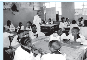
Picture 8.3. Students on group debating in class